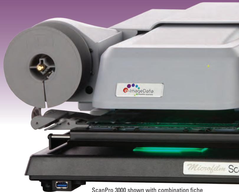
ScanPro 3000 shown with combination fiche and motorized 16/35 mm film carrier